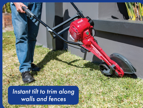
Instant tilt to trim along walls and fences

ALL MODELS WITH EXCLUSIVE LONG LASTING 4-BLADE CUTTING SYSTEM