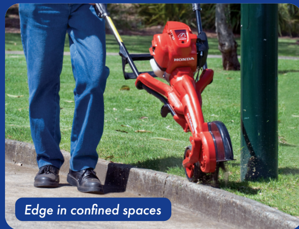
Edge in confined spaces