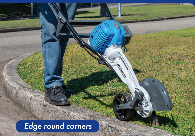
Edge round corners