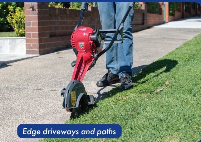
Edge driveways and paths

Australia & New Zealand's No.1 Selling Lawn Edgers